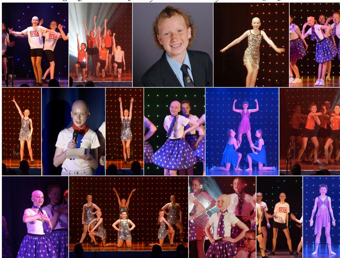
GCSE Dancer, Elite Team Member & True Warrior 'Flying with the Angels, Dancing with the Stars'