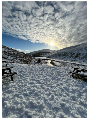
Second Place - Liam (Y11)