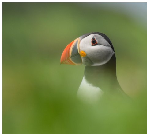
Joint Third Place - Róisín (Y8)