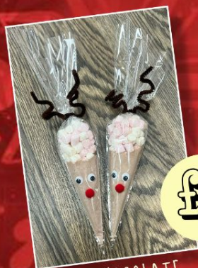
HOT CHOCOLATE REINDEER CONES