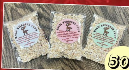
MAGIC REINDEER FOOD