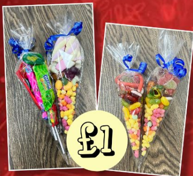
LOTS OF SWEETIE CONES!