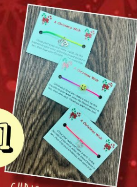
CHRISTMAS WISH BRACELETS