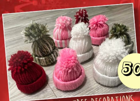
CHRISTMAS HAT TREE DECORATIONS