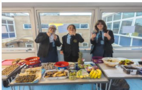
Parklands pupils and staff raise over £500 for the Syria/Turkey Earthquake appeal.

What happens now? Should the UK government continue to block bills of this kind from becoming laws in order to "be on the safe side" and protect women? Or is it unfair to block laws that could help protect transgender rights?