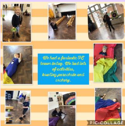
We had a fantastic PE lesson today. We had lots of activities, bowling, parachute and archery.

Pupils in school had a great time in their PE lesson. They loved bowling, archery and the parachute games. They even got to play a game of sleeping lions.