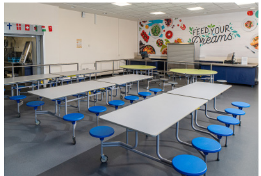
The Key Stage 3 dining room for pupils in Year 7, 8 & 9.