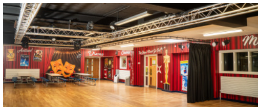
The Year 8 year group dining area.

Pupils may also eat in the dining rooms with their friends who have chosen to Eat In. We also have numerous picnic benches scattered around the site.