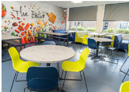
The Bistro for pupils in Years 10 & 11.