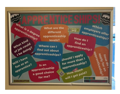
Moulsham High School, Chelmsford