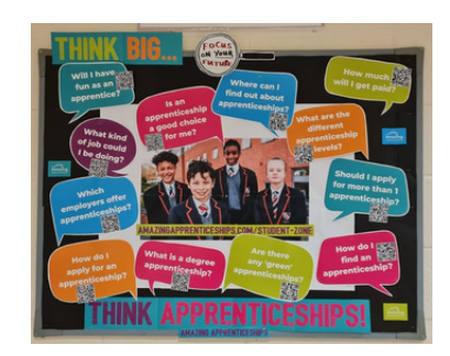
Lawnswood School, Leeds