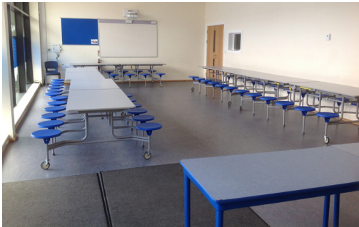
The Year 7 year group dining area.

Take Away food may be eaten in your year group dining area.