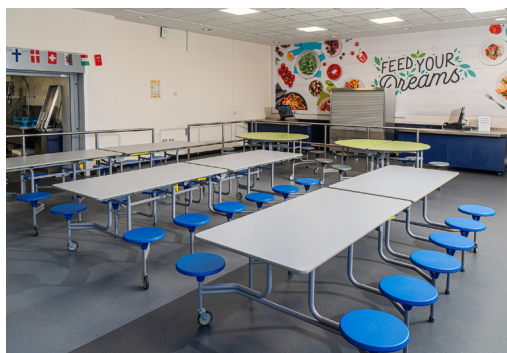
The Key Stage 3 dining room for pupils in Year 7, 8 & 9.