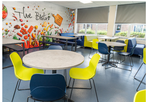
The Bistro for pupils in Years 10 & 11.