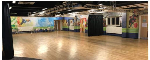
The Year 8 year group dining area.

Pupils may also eat in the dining rooms with their friends who have chosen hot food to Eat In. We also have numerous picnic benches scattered around the site.