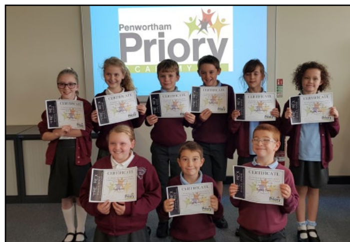
Photo below: Pupils from Penwortham County Primary School with their certificates.