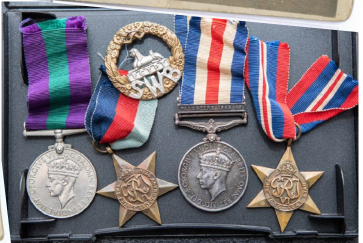
Gwilym Lloyd Jones - Left Photo: bottom row 4th from the left Right Photo: top row 4th from the left.