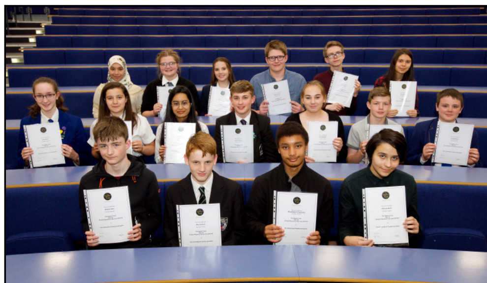
Picture shows winners from other Lancashire schools being awarded their certificates.