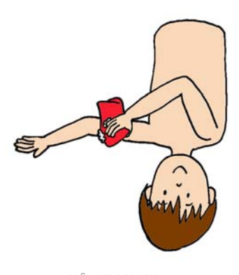
© Visual Aids for Learning com. Visual Aids for Learning...