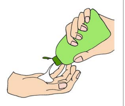
pour shampoo into hand