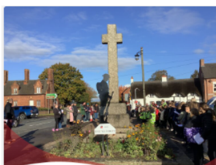
Remembrance Service 2023