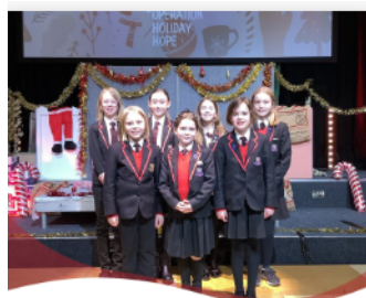
Operation Holiday Hope - Worship Council Trip