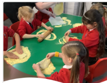
Class 2 enrichment day