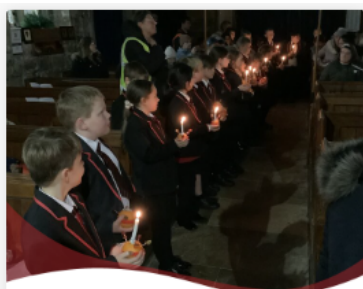
Christingle Service 2023