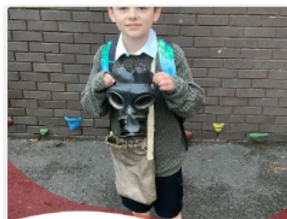
World War 2 Creative Day