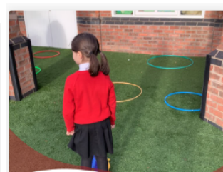
Whole School Maths Afternoon