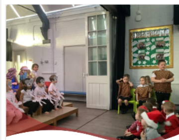
Whoops a Daisy Angel!