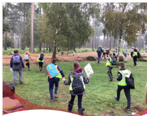
Cannock Chase Orienteering Trip 24/19/23