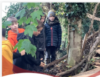
Class 4's Outdoor Learning Day