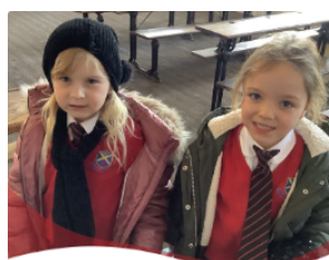
Black Country Museum Trip- Class 2