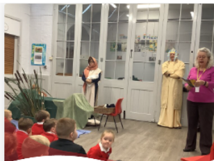
The Open Book Team - The Story of Moses