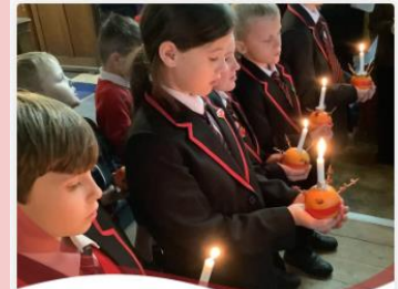
Christingle Service 2024