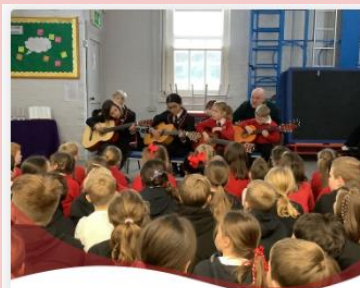
Christmas Guitar Concert