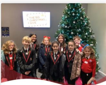
Worship Council Trip - The Big Christmas Give