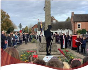
Remembrance Service 2024

https://www.richardcrosse.staffs.sch.uk/photo-gallery-category/school-gallery