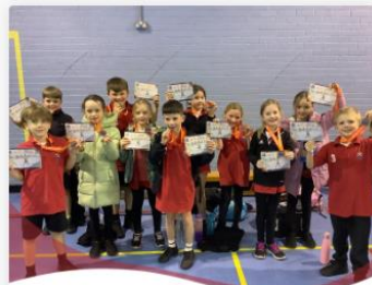
Year 3 & 4 Athletics Competition