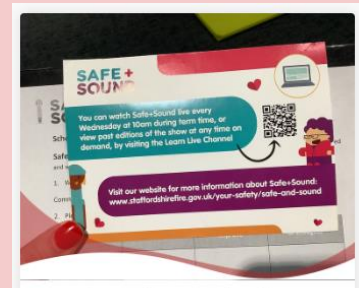
Safe and Sound - Fire Station Visit - Year 5