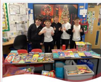
PTA Christmas Fayre