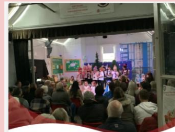
'Simply The Nativity'