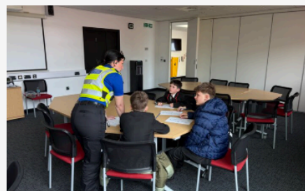
Year 5 - Safe and Sound Trip - 16/03/26