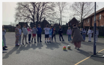
World Book Day 2026