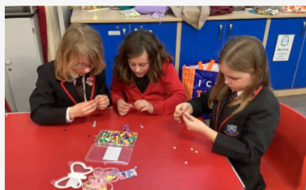
PTA Craft Evening