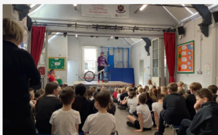
GB Athlete Visit 2026