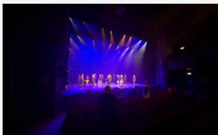
Lichfield Garrick Choir Performance

https://www.instagram.com/richardcrosseprimary?igsh=MW82a3g1Mmd0anc1dw%3D%3D&utm_source=g