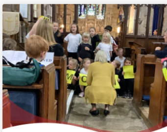
End of Year Service 2023