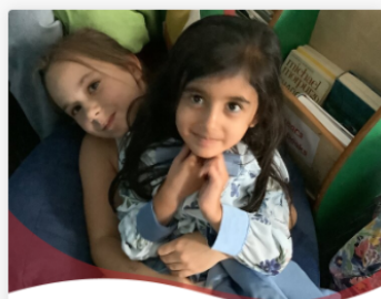
PTA School Disco