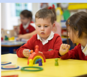
Design and Technology