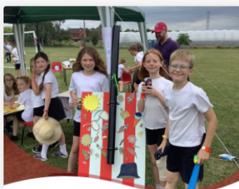
PTA Summer Fayre