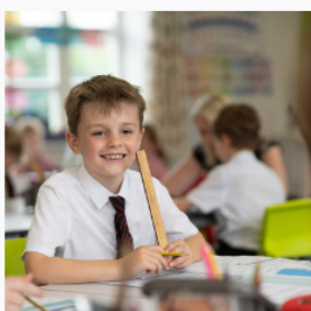
History & Geography