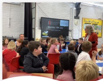
MAT Spelling Bee

We have also started to update the website with the new pictures of current children, so if you've not had a look recently, see if you can spot your child!