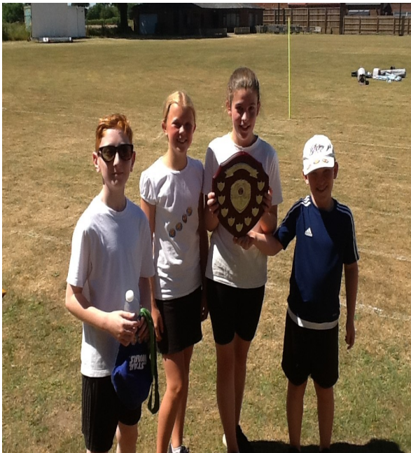
The winning Sports Day house captains

There will also be opportunities for parents to help support the project through directed active maths homework. Staff have been trialling active lessons over the last few weeks and it seems the children are responding extremely positively. We look forward to giving you more details at the beginning of the Autumn Term.