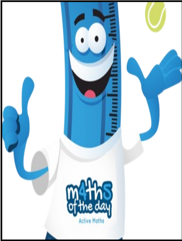
Meet Motty, the official Maths of the Day mascot