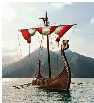
Viking Longship or Dragon ship.

Anglo-Saxons: The main group of people living in Britain when the Vikings invaded. Danelaw: The area of England ruled by the Danish Vikings. Longboat: A Viking ship with a sail and oars, also called a dragon-ship, used for fighting and carrying out raids. Monastery: A place where people who have dedicated their lives to religion, such as monks or nuns live. Pagan: A person who believes in many gods. Rune: A letter from the alphabet used by Vikings. Trader: A person who sells goods. Fjord: A long, narrow inlet with steep sides or cliffs, created by a glacier. Freeman: A person who is not a slave and free to choose who he or she worked for. Chieftain: The leader of a village or small group of people.