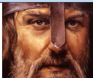
Vikings – AD 700 to AD 1100

King Alfred the Great (AD 849-899) Alfred did a lot of great things for England including defeating the Vikings in several battles and keeping part of England under Anglo-Saxon rule.