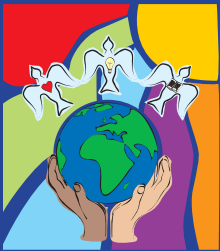
Rodbourne Cheney Primary School

Rodbourne Cheney Primary School The Broadway Rodbourne Cheney Swindon SN25 3BN