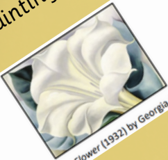
The White Flower (1932) by Georgia O'Keeffe