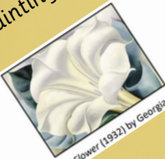
The White Flower (1932) by Georgia O'Keeffe