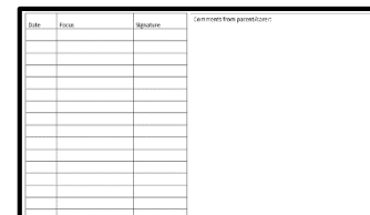
Rose Wood Academy: Enquiry Driven Learning Overview

Please can your child bring their signed Maths Knowledge Organiser every Friday.