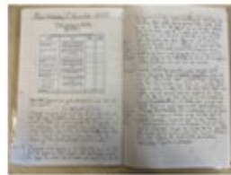
Figure 1: Mia STTG