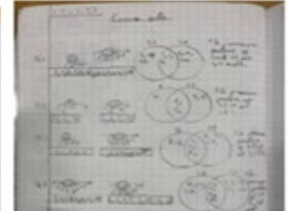
Figure 5: Children using factor bugs and Venn diagrams for finding common factors.

In reading , we have been reading 'Surprising Joy' by Valerie Bloom.