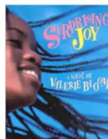
Figure 4: Surprising Joy. A story set in Jamaica telling of migration to the UK.

Ask your child to tell you about the story.