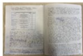
Figure 2: Rhys STTG

In Geography , children have been learning about human and physical geography with a focus on our local area. We have looked at maps of the area and identified the different features.