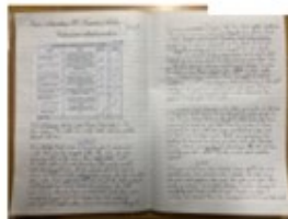
Figure 3: Tracy STTG