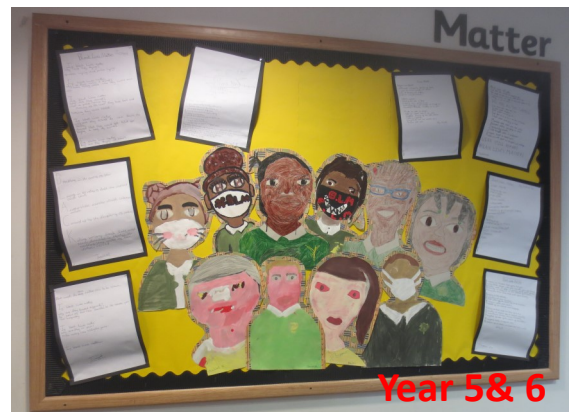
Year 5 & 6