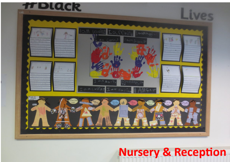
Nursery & Reception