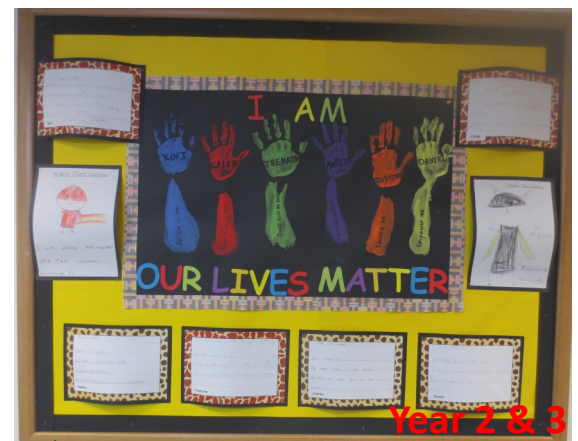
Year 2 & 3