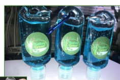
50ml Travel size refillable plastic bottle with clip hook for school bag or parent bag. £2.00 each