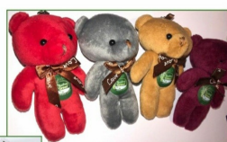
4" Teddy Bear with chain you can hang on your school bag or keys. Bear colours will be selected randomly £3.00 each