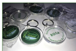
Round school logo keyring £1.00 each