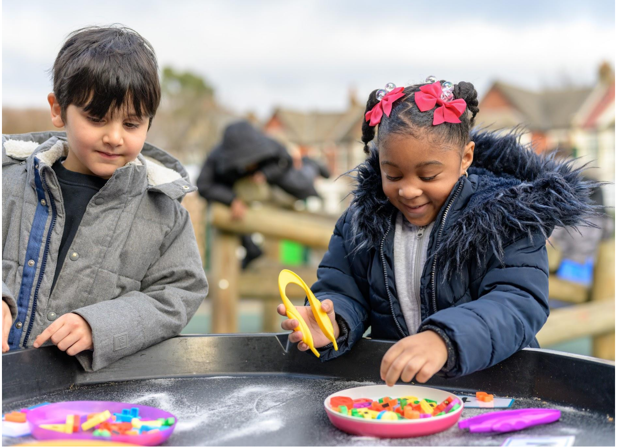
Sand word matching