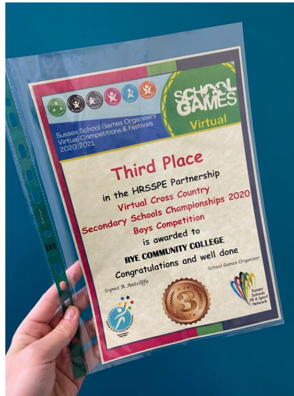
Boys 3rd Place overall