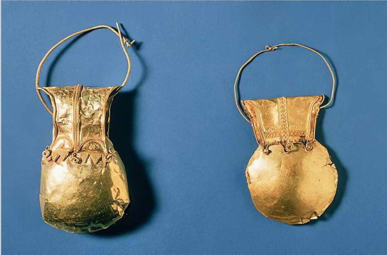
Bulla amulet, worn by freeborn Roman children