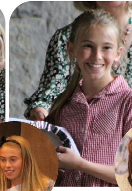
Contribution to School Life Plate Academic Achievement