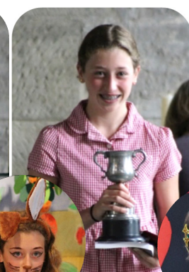
P.E. Cup Art Plate