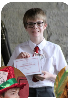
GK Plate Creative Writing Cup