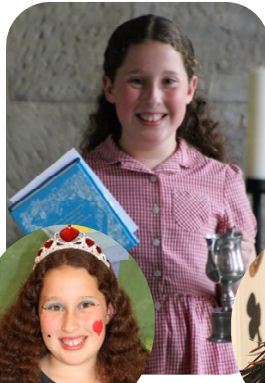
Drama Cup Perseverance Cup