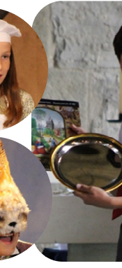
Spirit of Sacred Heart