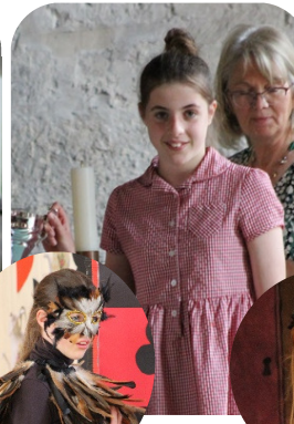
Drama Cup LOVE Award