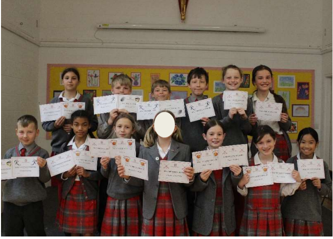
Tunbridge Wells Arts Festival Cup Winners