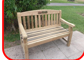
Y6 Friendship Bench

Key policies are available via the school website or on request from the school.