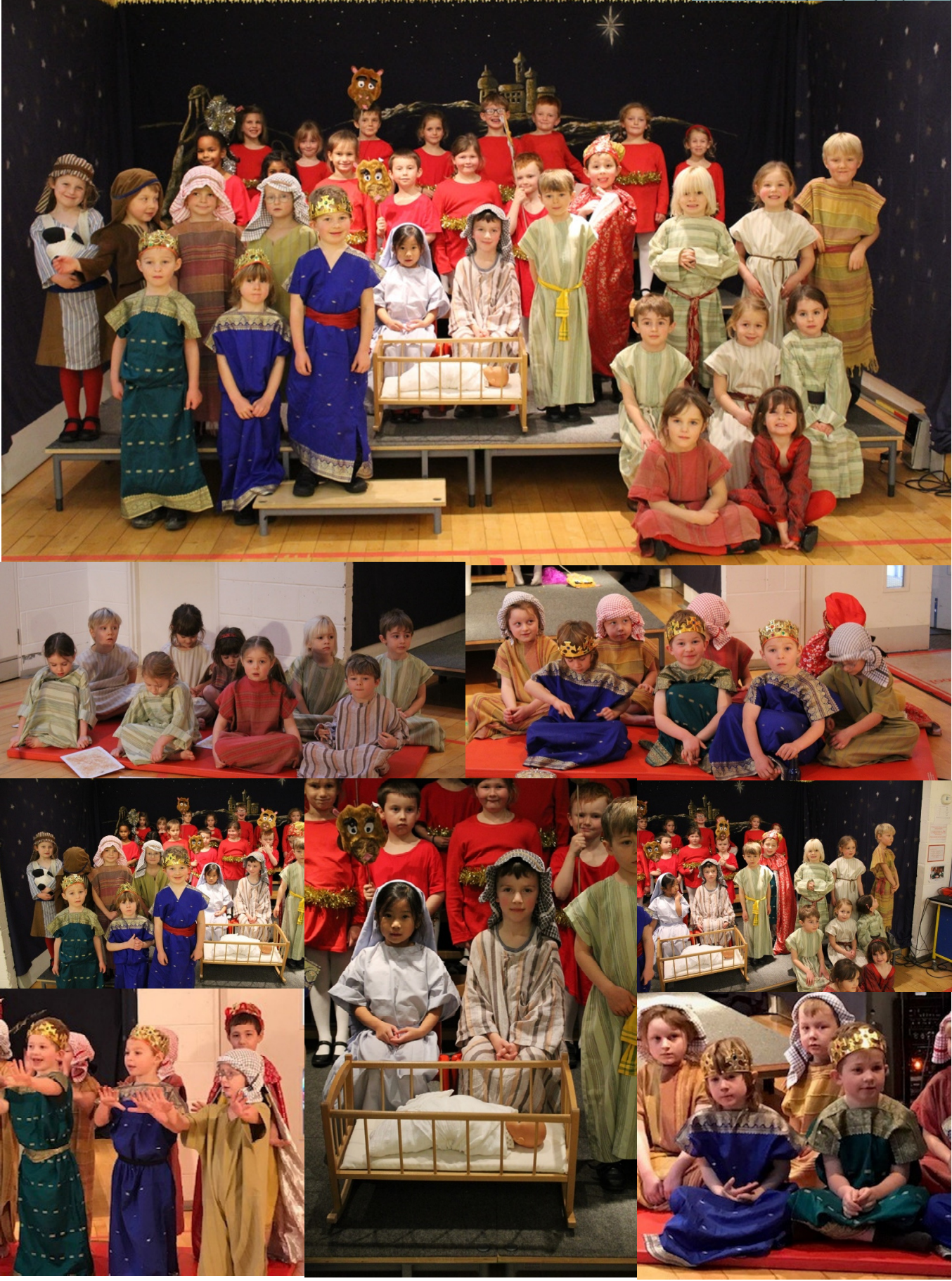
Key policies are available via the school website or on request from the school.