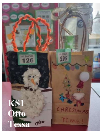
KS1 Otto Tessa