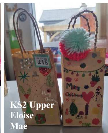
KS2 Upper Eloise Mae