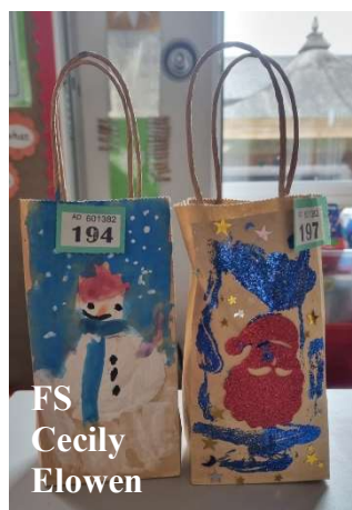
FS Cecily Elowen