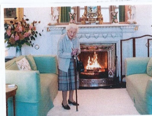
The last picture of the Queen looking happy but frail.

The state funeral will be held at 11:00am on Monday 19 th September, which is now a bank holiday for people to place flowers for pay their respects to the Queen. Millions of people are expected to watch the service at Westminster Abbey.