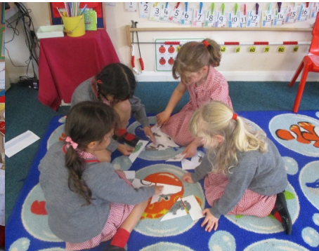
Reptile jigsaws in Science. Matching head, tail, torso and legs – if any! We managed to assemble them all!