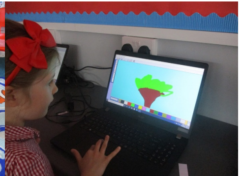
Drawing a tree using the brush, fill, redo and undo options in the Colour Magic program.