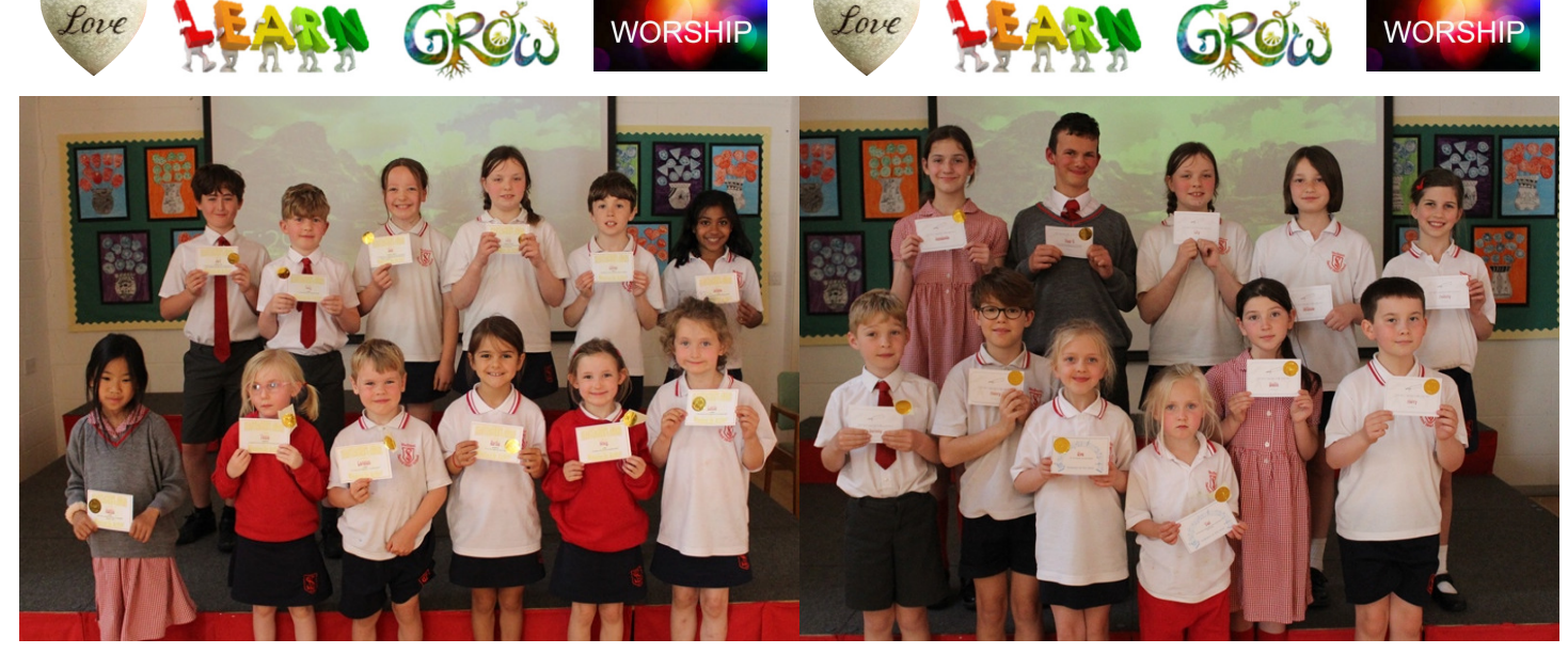
Key policies are available via the school website or on request from the school.