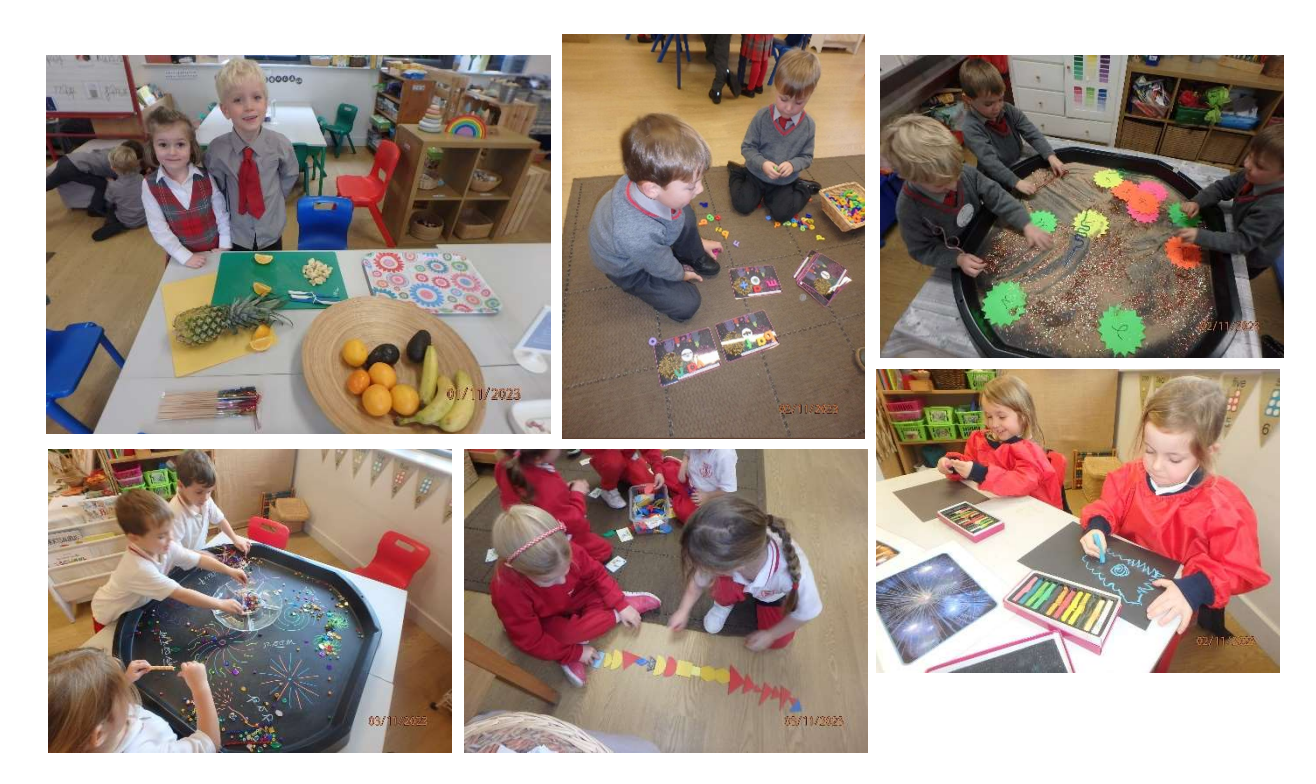
Key policies are available via the school website or on request from the school.

We then got to try the delicious fruits, creating rocket kebabs. We have also been busy celebrating Bonfire Night.