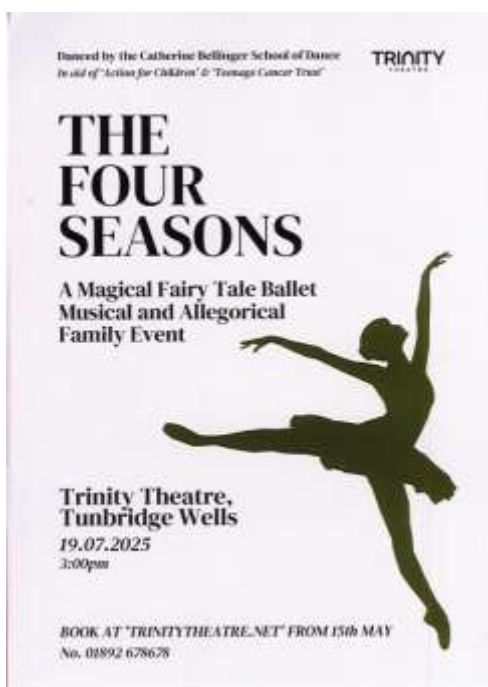
Poppy R (Y6) and Poppy C (Y3) will be dancing in The Four Seasons.