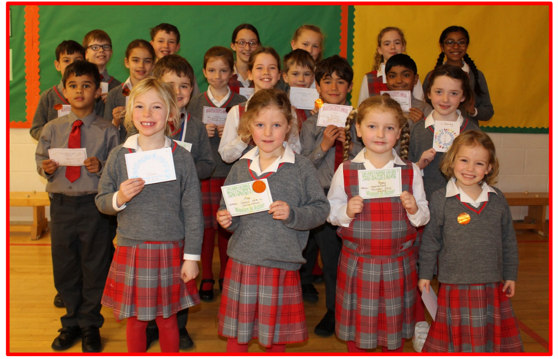
Key policies are available via the school website or on request from the school.