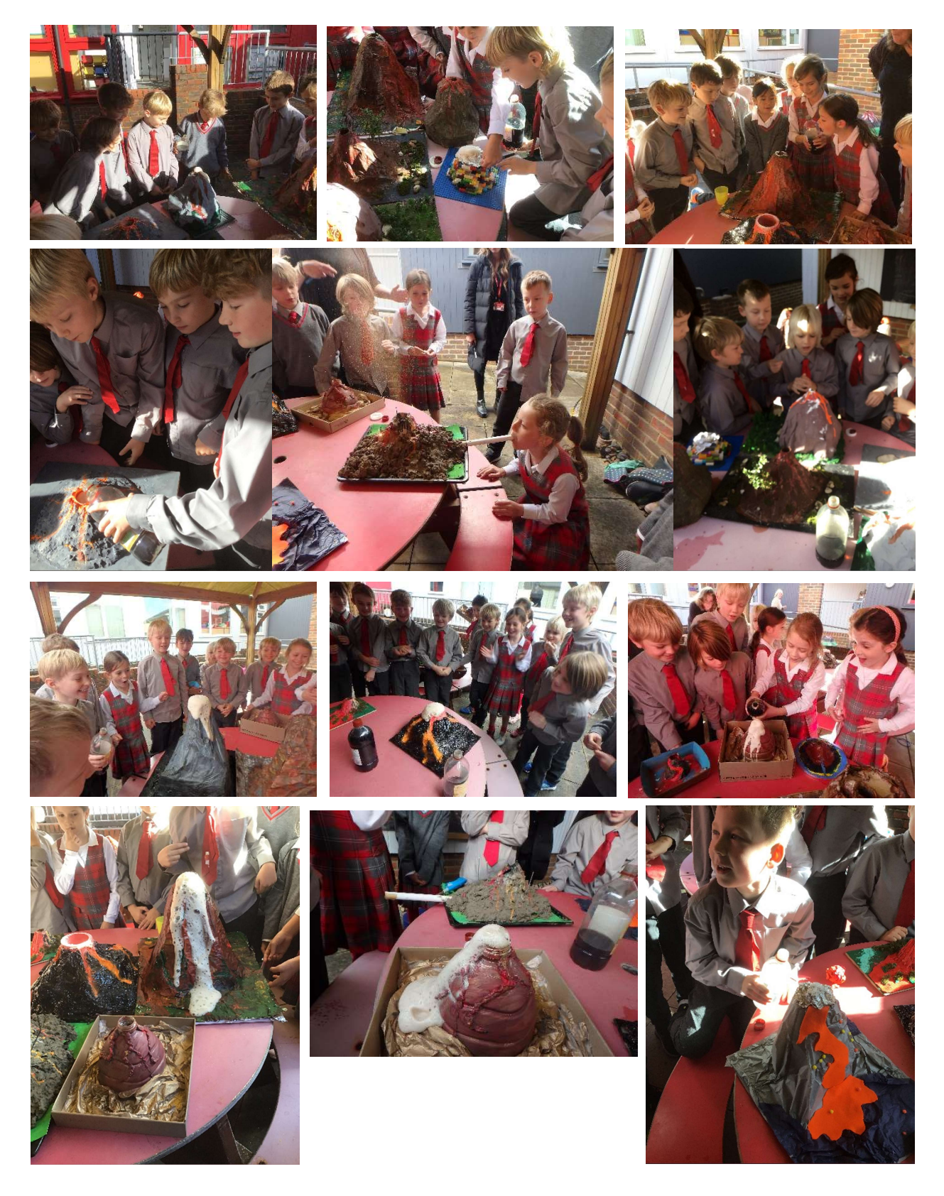
Key policies are available via the school website or on request from the school.

Year 4 were set the task of making volcanoes over the half term and everyone was so impressed with their work! Every volcano was unique, they were different sizes, made from a variety of materials and they all looked spectacular! It was clear that the children had put in a lot of time and effort and many had included details such as trees, the sea and even people! We had lots of fun erupting the volcanoes using a combination of vinegar and bicarbonate of soda and one volcano even erupted glitter! Great work, Year 4!