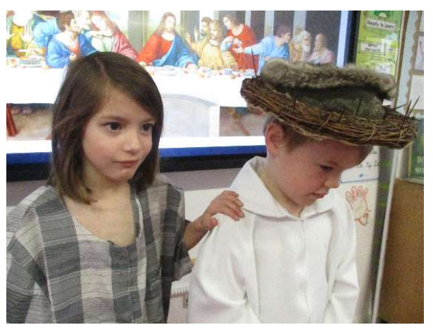
Lord, You love us with an everlasting love. You showed us how much you love us and taught us to love you, ourselves and one another. Teach me to use my hands... to use my feet... to use my mind... to serve others. Help me to show the commandment, Love one another.