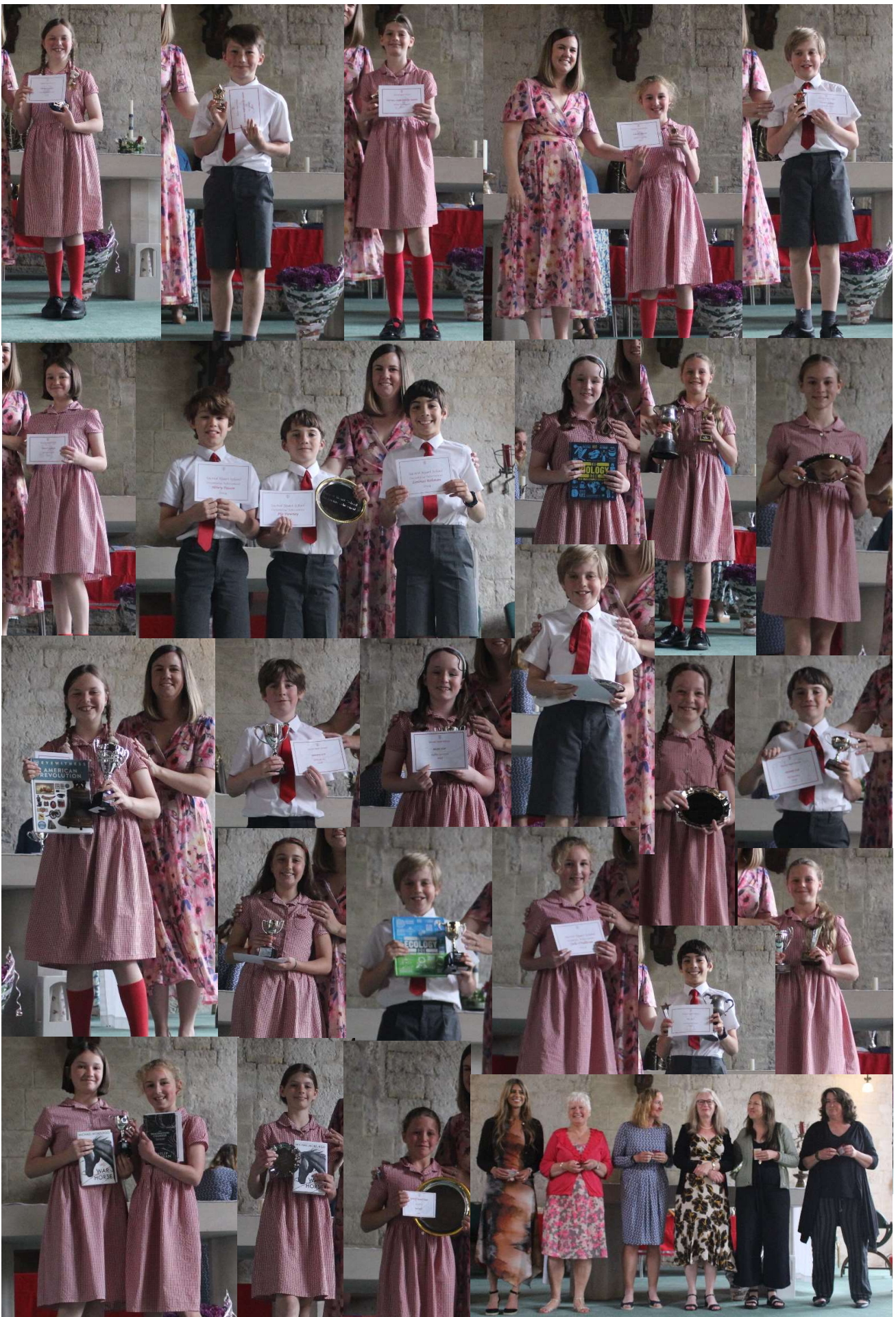
Key policies are available via the school website or on request from the school.