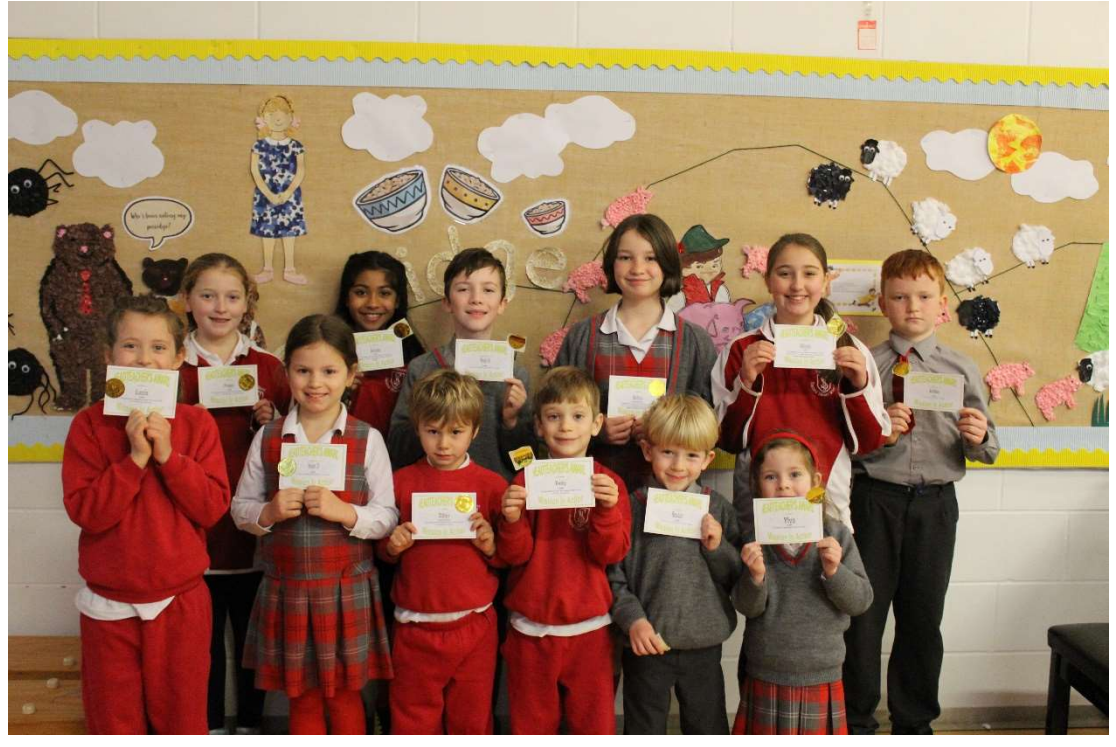
Key policies are available via the school website or on request from the school.