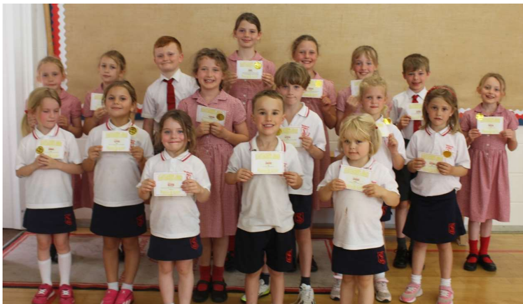
Key policies are available via the school website or on request from the school.