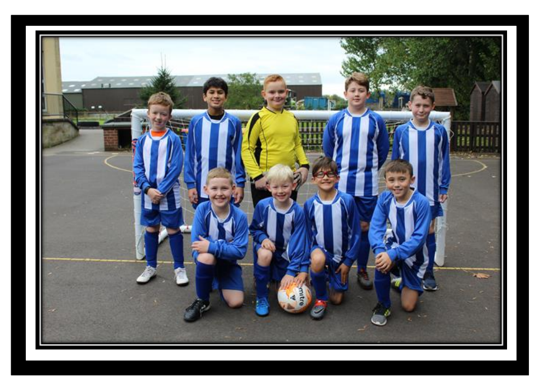
Well done to the football team!