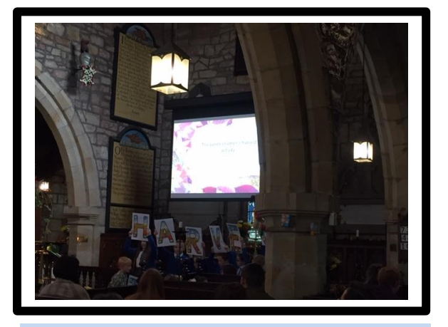
What a fabulous Harvest Service in church last Sunday – well done to all who took part!