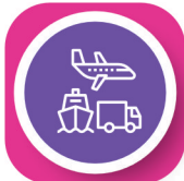
TRANSPORT & LOGISTICS