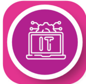
IT, SOFTWARE & COMPUTERS