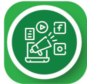
ADVERTISING & MARKETING