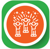
ENTERTAINMENT & PERFORMING ARTS