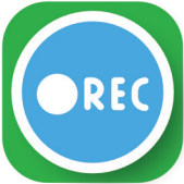
RECORDING & PRODUCTION