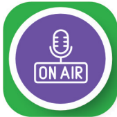
MEDIA & BROADCASTING