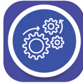
ENGINEERING & MANUFACTURING