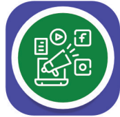
ADVERTISING & MARKETING