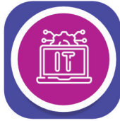
IT, SOFTWARE & COMPUTERS