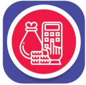
BUSINESS & FINANCE