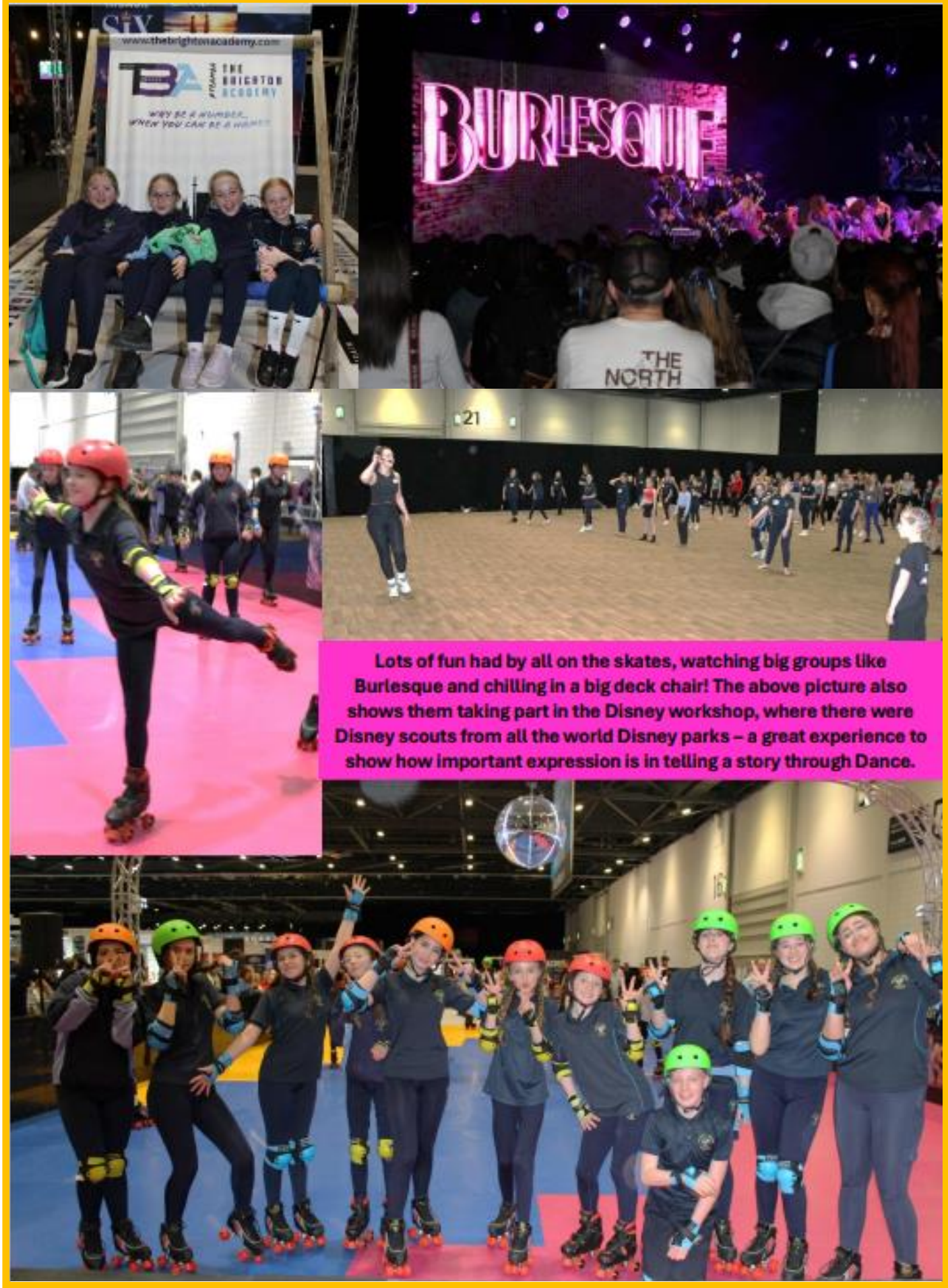
Lots of fun had by all on the skates, watching big groups like Burlesque and chilling in a big deck chair! The above picture also shows them taking part in the Disney workshop, where there were Disney scouts from all the world Disney parks – a great experience to show how important expression is in telling a story through Dance.